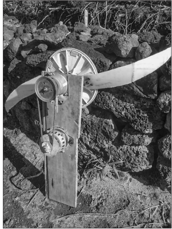
Figure 7. The wind turbine designed and assembled entirely from recycled materials by TAO students.

TAO 2015 was truly a community effort. Many individuals on the island, including staff at Explora, the Museo Antropológico Padre Sebastián Englert,