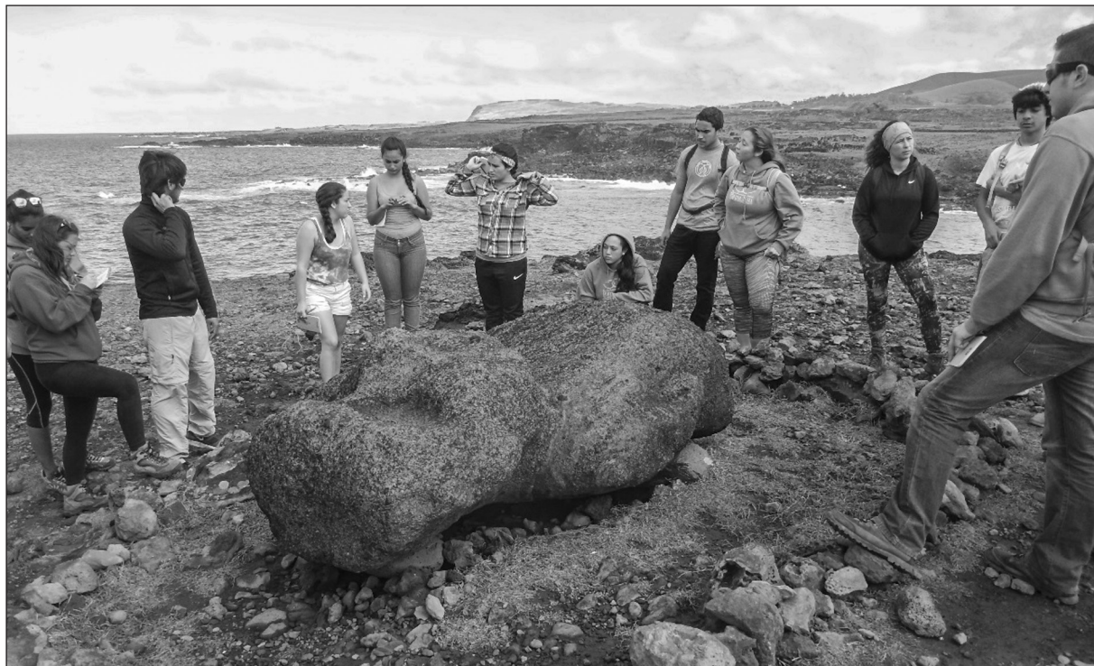
Figure 1. TAO students and staff visit Ahu Akahanga.

For two weeks, TAO students and staff lived and worked together, camping on land provided by Explora Hotel and Mike Rapu. In addition to the activities and projects specific to the two tracks, the entire TAO cohort participated together in a number of excursions, activities, hiking trips, and a series of eight evening lectures by experts on the island’s history, geology, wildlife, and archaeology (see Figure 1). The immersive nature of the program, and the sense of community it fosters among the participants, enables